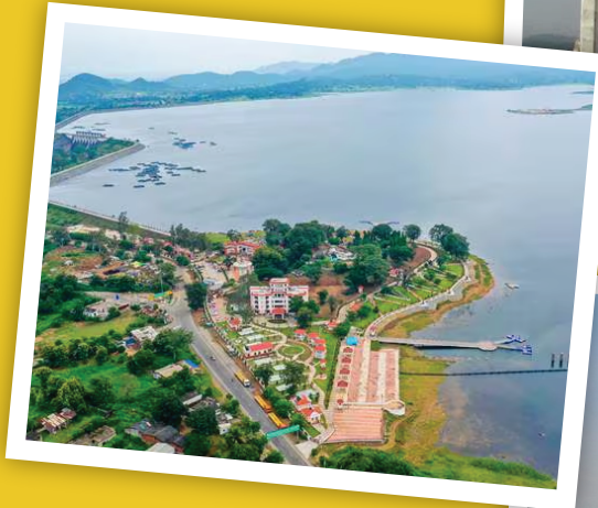
Patratu Lake Resort