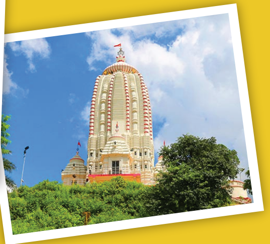
Sri Jagannath Temple